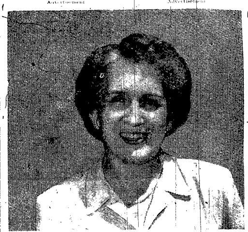
Happiest Mother of 1951